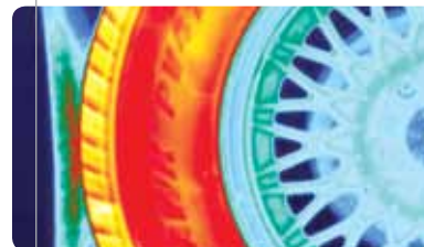
Stop-motion image of spinning tire