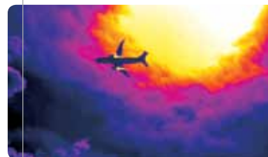
737 across the sun