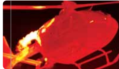
Helicopter in flight